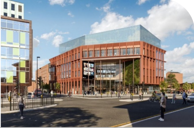
Investing in our future – East Midlands IOT and University of Derby Business School