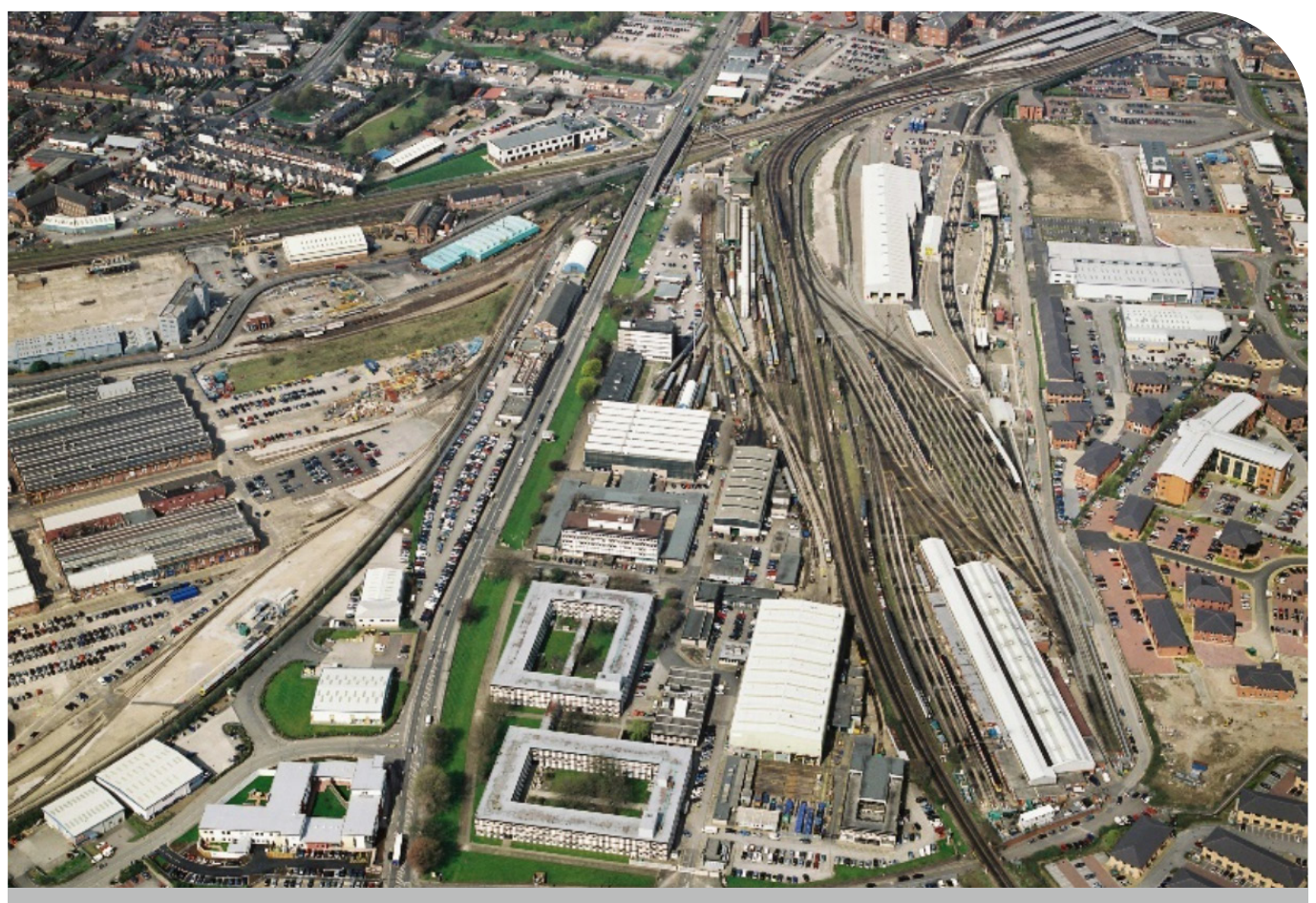
The opportunity to locate GBR at the very heart of Europe's leading rail cluster

Locating GBR alongside the East Midlands rail cluster will: