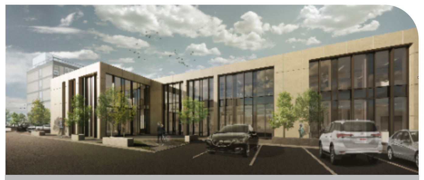
RTC Derby - 21st century HQ, building on our unique rail innovation heritage

RTC Derby, our primary site option, provides outstanding value for money and a unique opportunity to build on the UK's rail innovation history. It has a long history as a centre for rail innovation and excellence. It remains a cluster for rail businesses wishing to locate together. The complex offers a combination of office, workshop and laboratory space, with a total floor space of 320,000 sq. ft across 26 acres. RTC Derby is a DfT asset managed by London & Continental Railways.