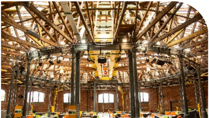
Oldest railway roundhouse in the UK – pictured in 1960 - now part of the Derby College Campus opened in 2009

Since 1840 railway vehicles have been manufactured in Derby, a tradition that continues today with Alstom supplying the new HS2 trains.