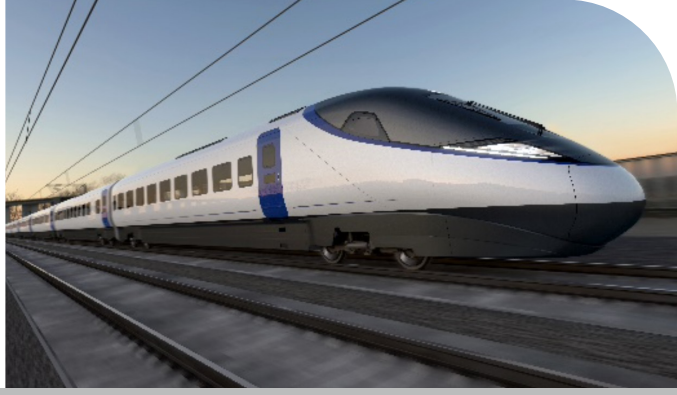
The story continues - last steam engine built in Derby (1957) to the new HS2 trains of the future